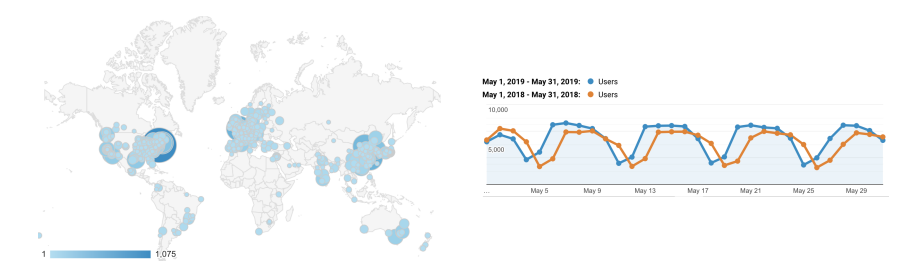
Figure 3: Bioconductor Access Statistics Left: international visits, trailing 12 months. Right: Web site access, May 2018 (orange) and 2019 (blue).

Table 5: PubMed title and abstract or (2012 and later) PubMedCentral full text searches for "Bioconductor" on publications from January, 2003 – June, 2019